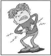
We live in a tuffan world